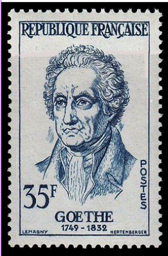
France #863: Goethe (issued 11-9-1959)