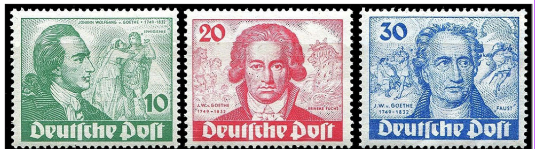
10 pf: Goethe & Iphigenie * 20 pf: Goethe & Reineke Fuchs * 30 pf: Goethe & Faust Germany West Berlin #9N61-63 (issued 7-29-1949 for his birth bicentennial)

"Goethe's Rebirth in Rome" (8-23-1787); "Earth Inhaling & Exhaling" (4-11-1827); "Goethe on Literature" (10-11-1828); "Goethe on Peace" (1780 & 1808); "Goethe on Rubens" (4-18-1827); "Goethe & Alchemy" (1768-1769); "Goethe & Heidelberg" (1795 & 1797); "Goethe's "Gingo Biloba" (9-23-1815); Poem: "Meeting Goethe in Heidelberg" (12-13-2007) & Notes (12-19-2007).