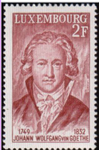
Luxembourg #593: Goethe (issued 3-14-1977)