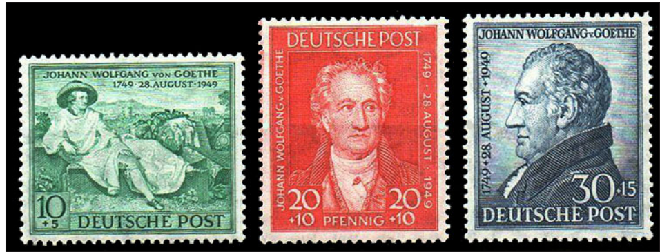
Germany #B306-B308 (issued 8-15-1949 for his birth bicentennial)