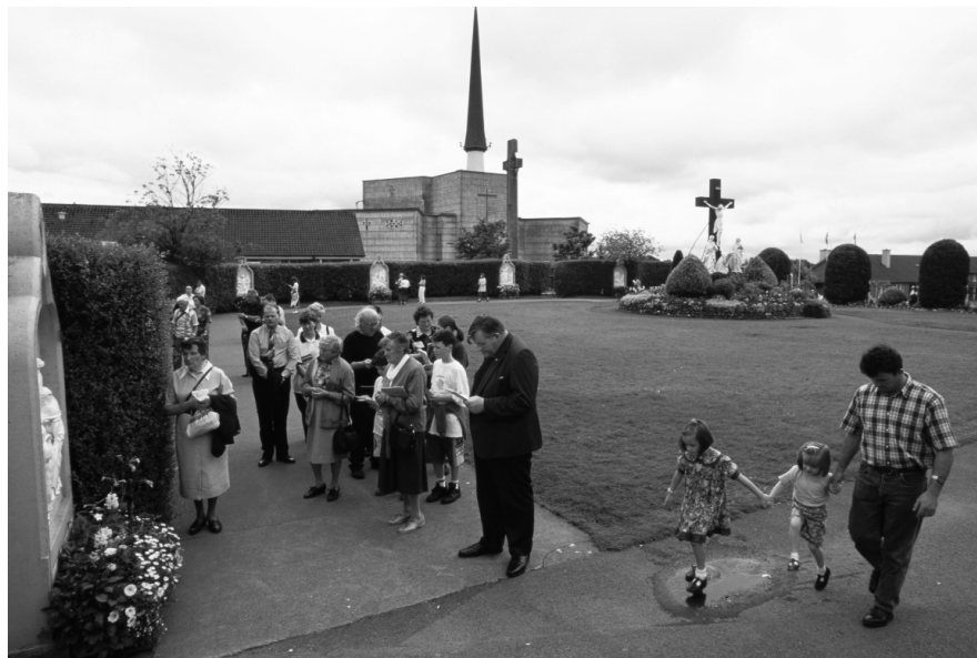
Praying Near Shrine of Knock, Ireland, 1995.

Here, the transcendent broke into time . The conjunction of transcendence and temporality, the particularity of here with the no-place or beyond-all-places of transcendence, exemplifies the unexpected confluences within Marian devotions of categories normally (meaning normal within the languages of the